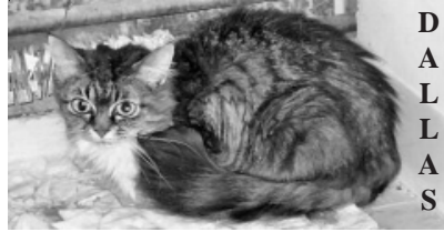
D A L L A S

HERE ARE SOME PURR-FECT COMPANIONS FOR YOU