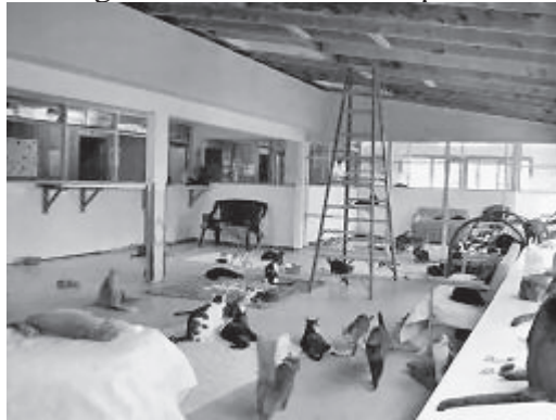
Gang room at the start of repairs